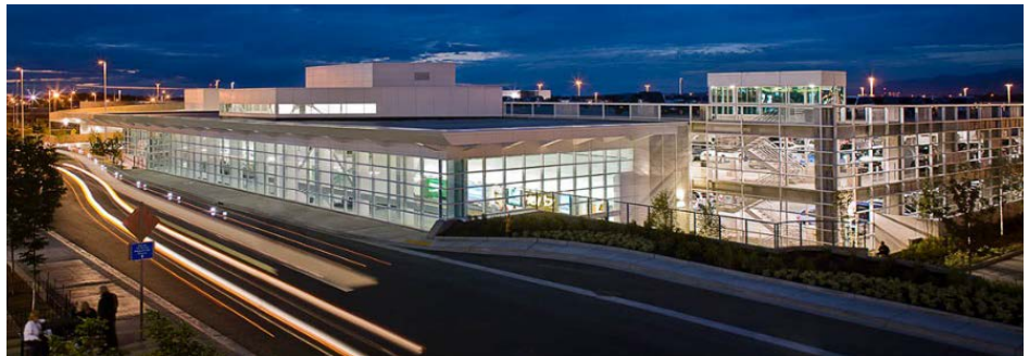
TSAIA CONRAC Facility