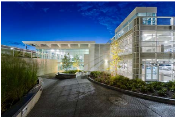
TSAIA CONRAC Facility