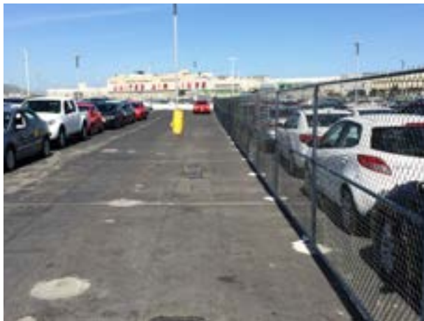
2017 QTA Fence Row

This year's reallocation project was done differently than anticipated because airport took away 16,849 sq. ft. from the QTA parking lot. They took away the space because the airport needs to extend the AirTrain to the long-term parking and is using this area temporarily for staging of materials. Because they took this away from everyone, they volunteered to move the fence at their expense. The airport contracted the work with Skanska Construction and they were able to reuse the materials (all bases and fencing) and completed the project within a week, an incredibly quick turn-around time for this project.