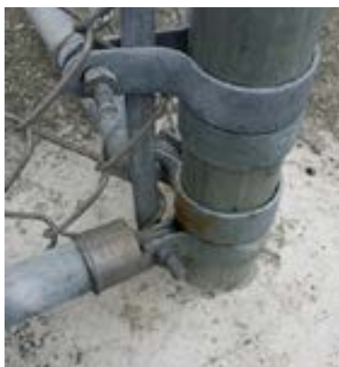
2017 QTA Fence Anchor

This year's reallocation project was done differently than anticipated because airport took away 16,849 sq. ft. from the QTA parking lot. They took away the space because the airport needs to extend the AirTrain to the long-term parking and is using this area temporarily for staging of materials. Because they took this away from everyone, they volunteered to move the fence at their expense. The airport contracted the work with Skanska Construction and they were able to reuse the materials (all bases and fencing) and completed the project within a week, an incredibly quick turn-around time for this project.